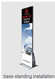
base standing installation